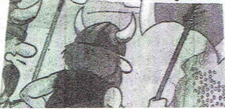
"Good news, General. Only the first row is real. The rest are computer generated."

are you going to talk with Santa? the newscaster asked. "No!" "Why not?" "Because the real Santa is at the mall."