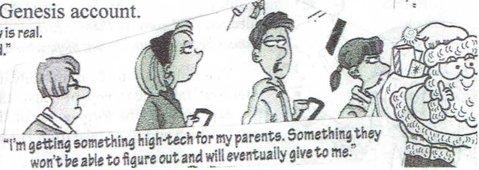
"I'm getting something high-tech for my parents. Something they won't be able to figure out and will eventually give to me."