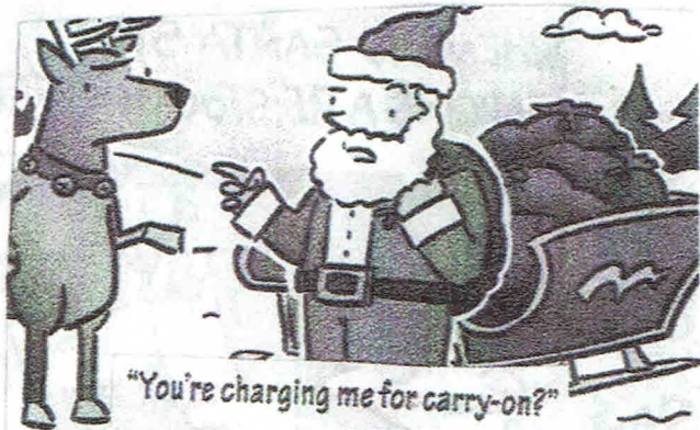
"You're charging me for carry-on?"

According to legend, Lydia Darragh saved the Continental Army when she overheard the British planning an attack. British General William Howe had commandeered a room in her house for his headquarters. Darragh reportedly eavesdropped from an adjoining room and passed the information to American soldiers. Upon their arrival, the British discovered the Continental Army waiting for them, and General Howe's army retreated after three days of skirmishing.